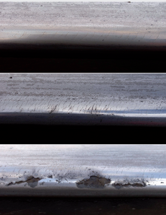
HeadCheck stage 3, stage 2, stage 1

HeadCheck has been specially developed for the detailed automatic inspection of the rail running edges. At a speed of 100 km/h the system checks the edges for fine Head Checks and assigns them different states.